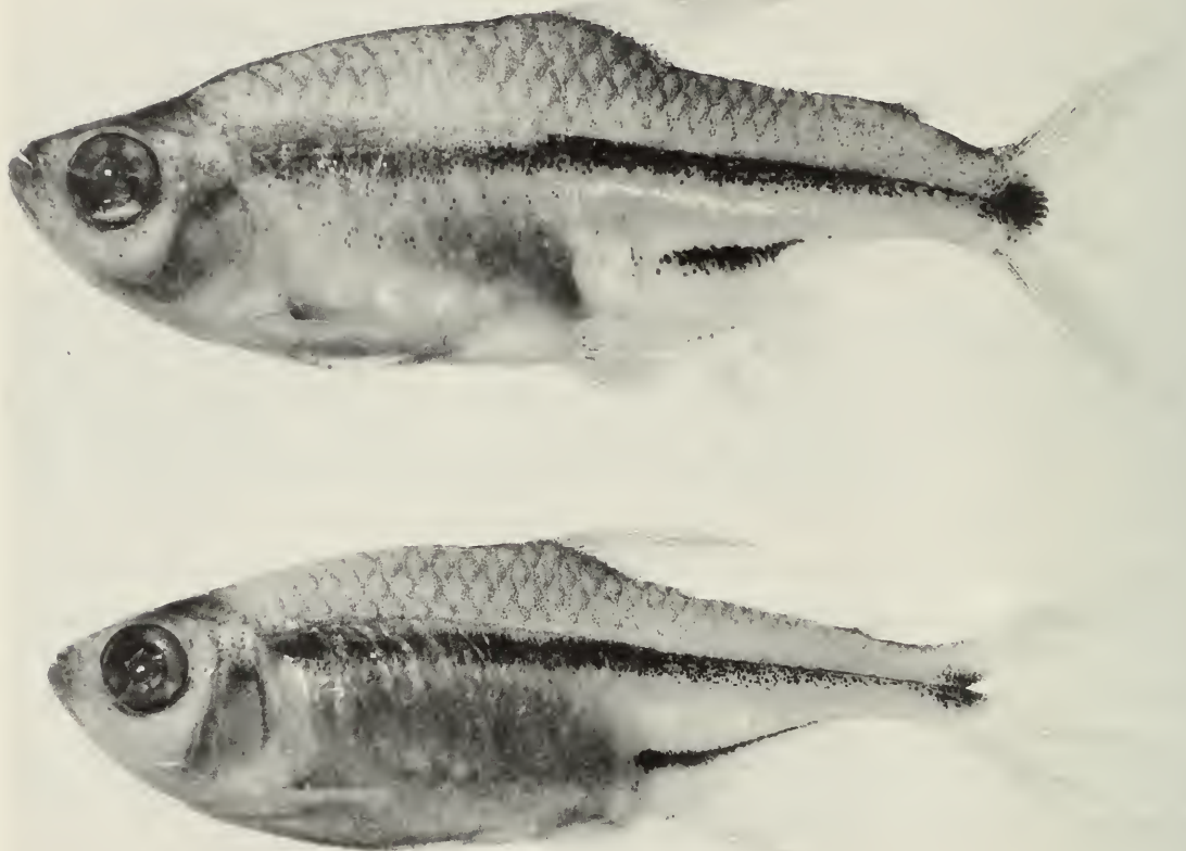
Fig. 1. Cheirodon ortegai , holotype (upper), male, AMNH 35950, 31.4 mm SL; and paratype (lower), female, AMNH 35951, 31.2 mm SL.

35951) 28.0 mm SL, taken with the holotype; one juvenile female? (Géry collection), collected by W. Baumler, 1965, in the Río Pachitea at its junction with the Río Ucayali; 1 male, 34.3 mm SL (Géry collection), no locality data; 1 female, 34.0 mm SL (Géry collection), no locality data.